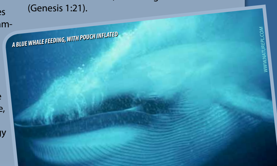
A BLUE WHALE FEEDING, WITH POUCH INFLATED