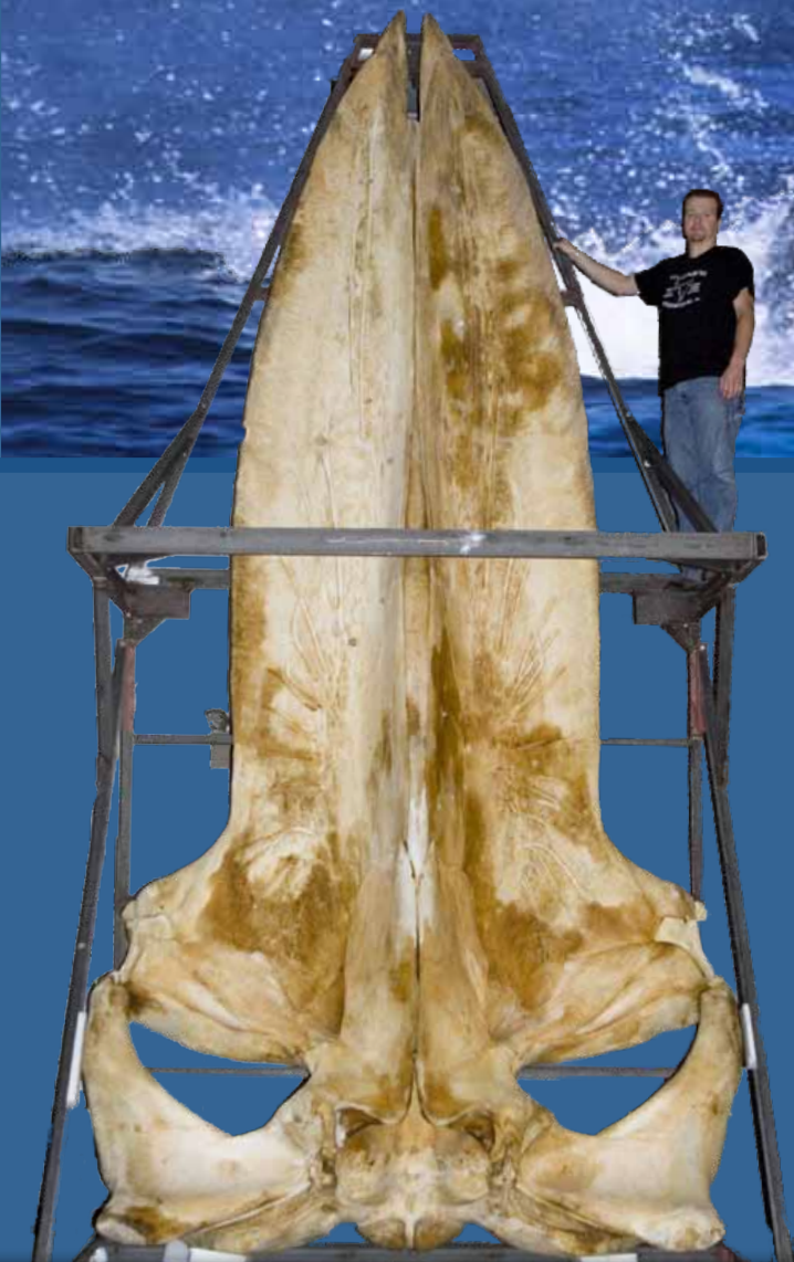
A 19-Foot-tall SKULL OF a BLUE WHALE