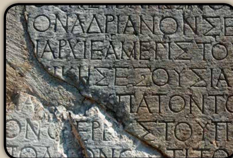
Above: A fragment similar to the Gallio Inscription found in the City of Delphi

Only a book divinely inspired by God could write about thousands of people, places, and events and be correct all the time. Truly, “all Scripture is given by the inspiration of God.”